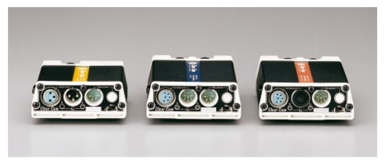
Bottom of RS-501, RS-502 & RS-522