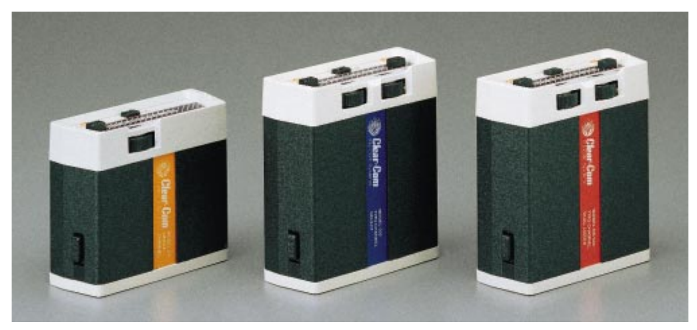
RS-501. RS-502 & RS-522