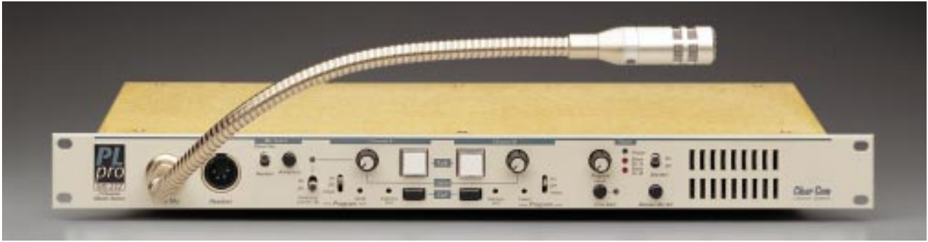
MS-232 Front Panel